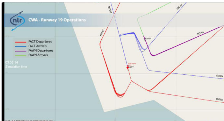
Figure 2: Runway 19 Operations