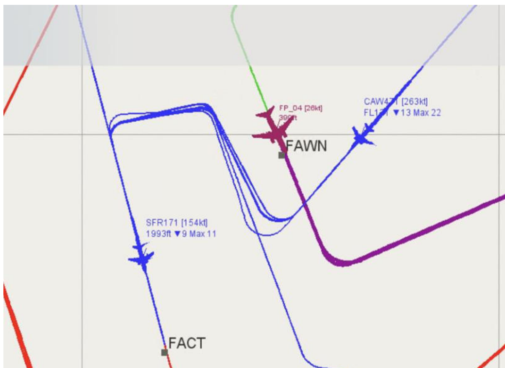
Figure 4: Conflict Detection