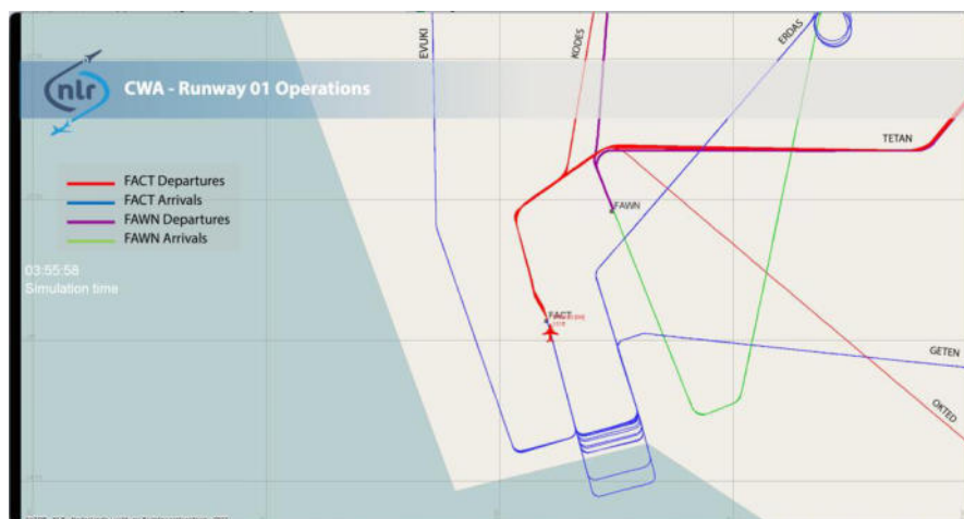
Figure 1: Runway 01 Operations