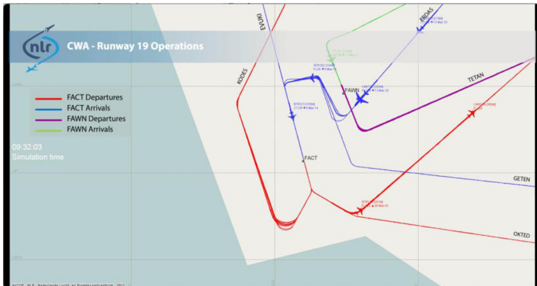
Figure 3: Traffic Flow Analysis