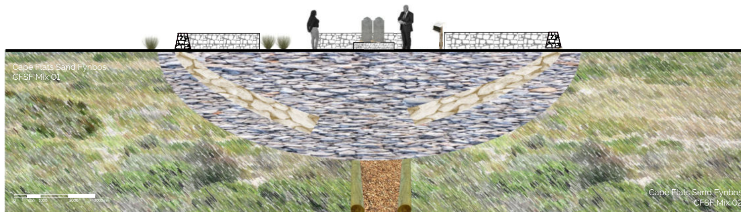
Plan Section 02 Remembrance stone central cycle 5.01

Pathways to circle to be bordered by gum poles and filled with 13mm crushed stone aggregate ('klippies'), similar to other areas on campus.