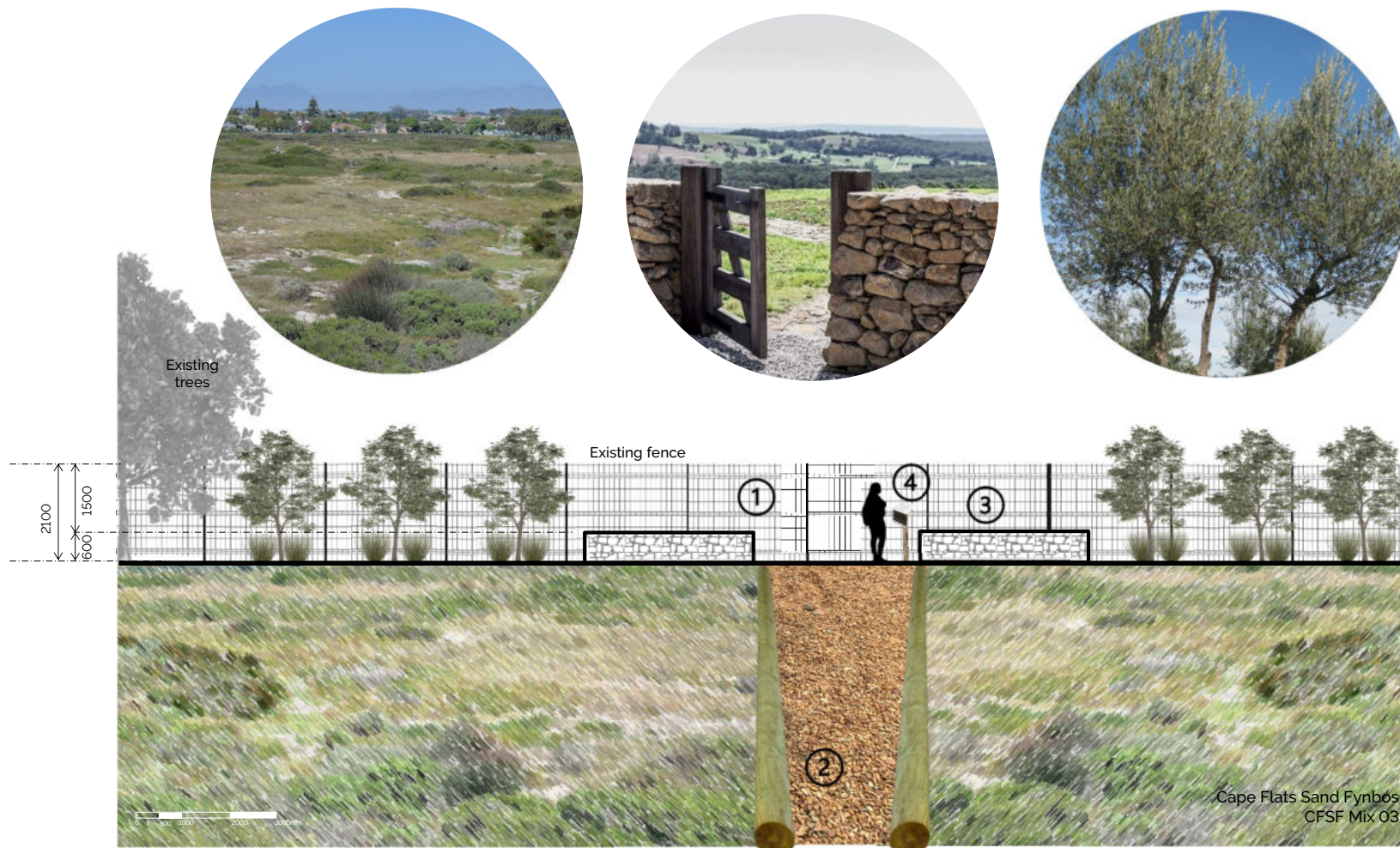
Plan Section 03 Symbolic entrance on south boundary

FILE PATH F:\Assets\Tygerberg Campus\Grounds\SL_Landscape Architect\Tygerberg.pln