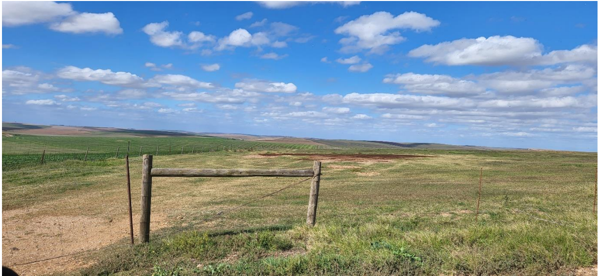
Photo 3: Site photo of the site where the new development is proposed (facing east).