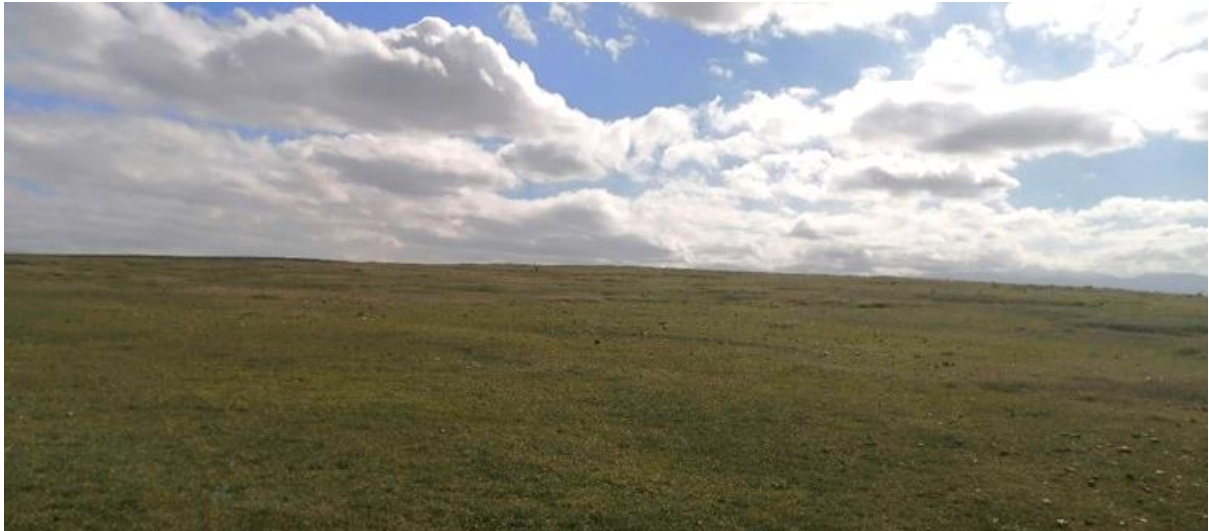
Photo 4: Site photo from the site where the new development is proposed (facing west).