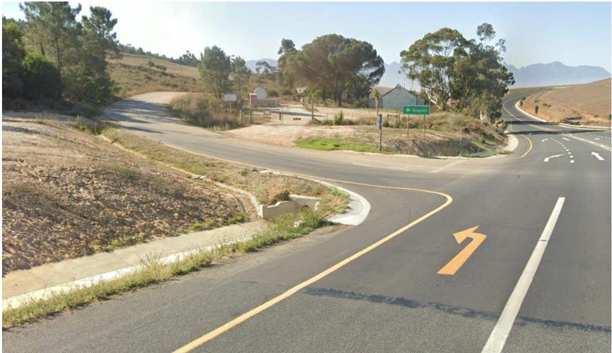
Photo 1: View of the turnoff from the N2 onto the farm's primary access road