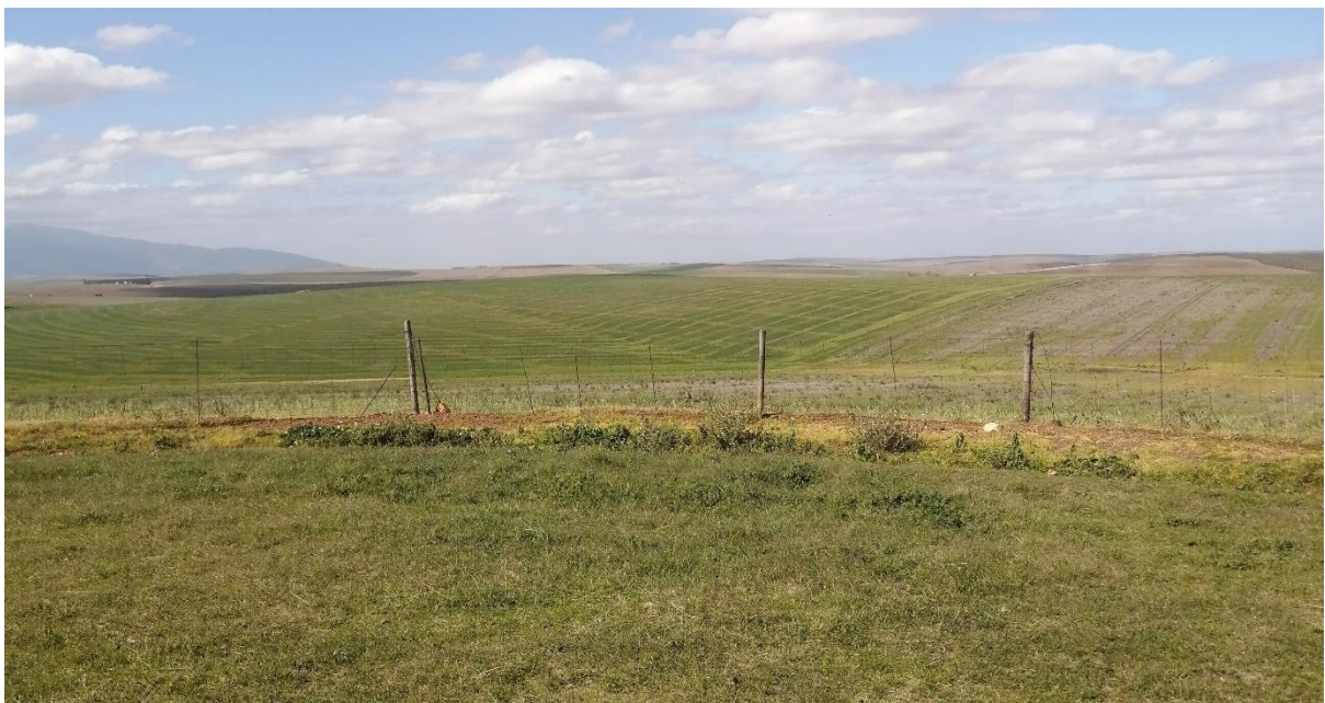
Photo 5: Site photo from the site where the new development is proposed (facing northeast).