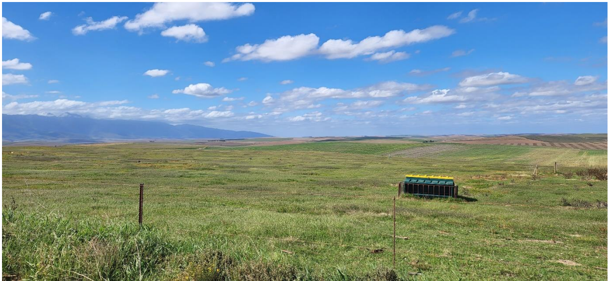
Photo 2: Site photo of the site where the new development is proposed (facing east).