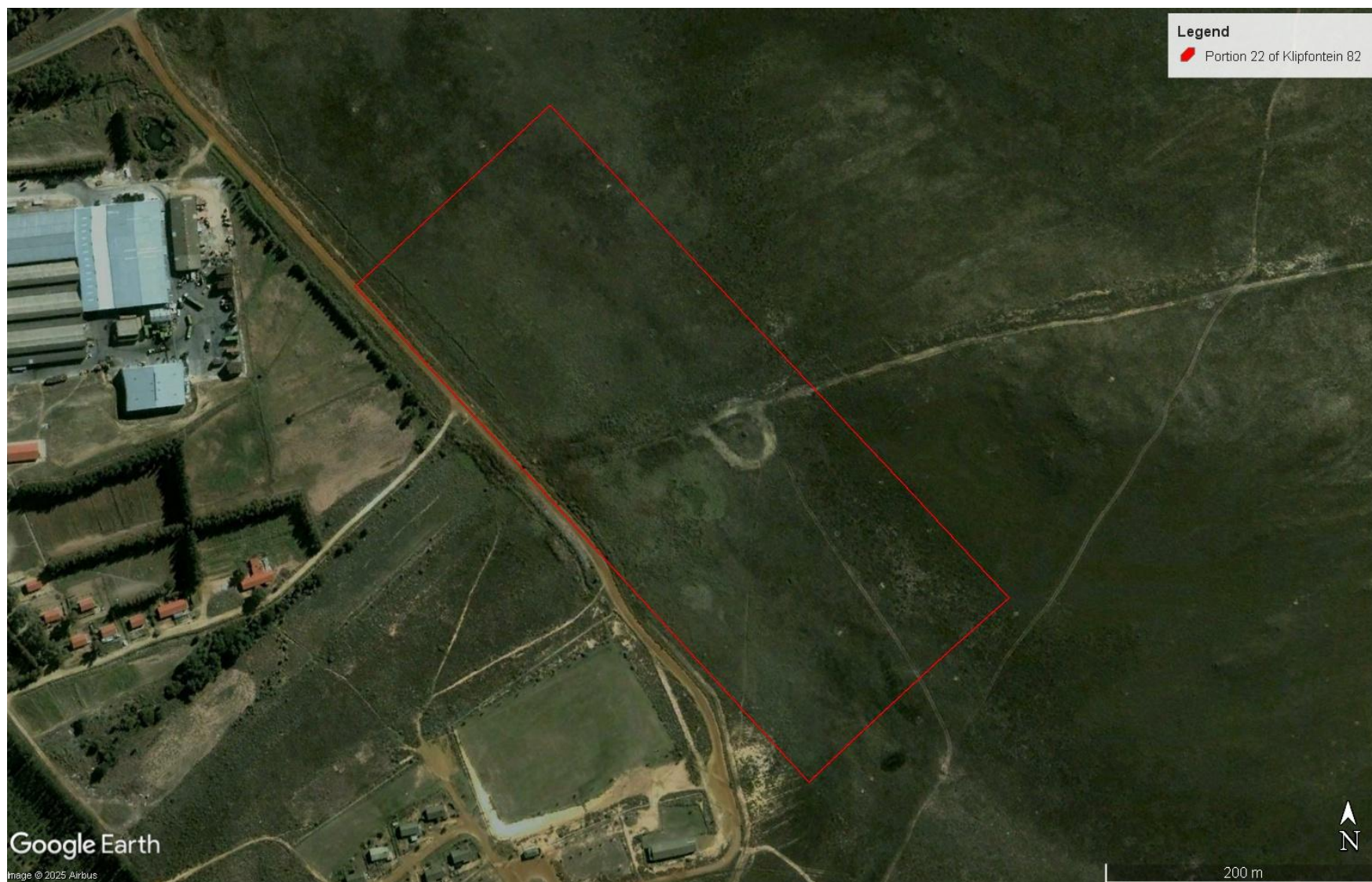
Figure 1: Aerial imagery from 2004 showing the study area prior to undertaking of unauthorized vegetation clearance.