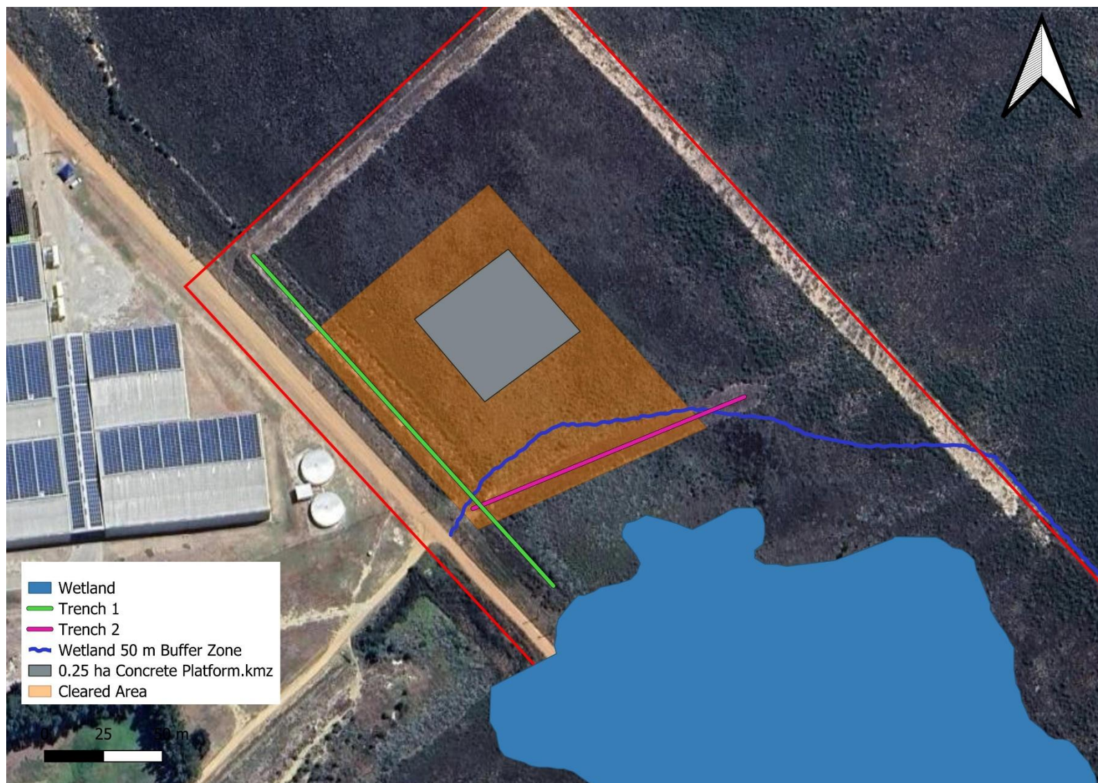
Figure 3: Map of the current site layout i.e. Alternative 1. This is the activities completed.