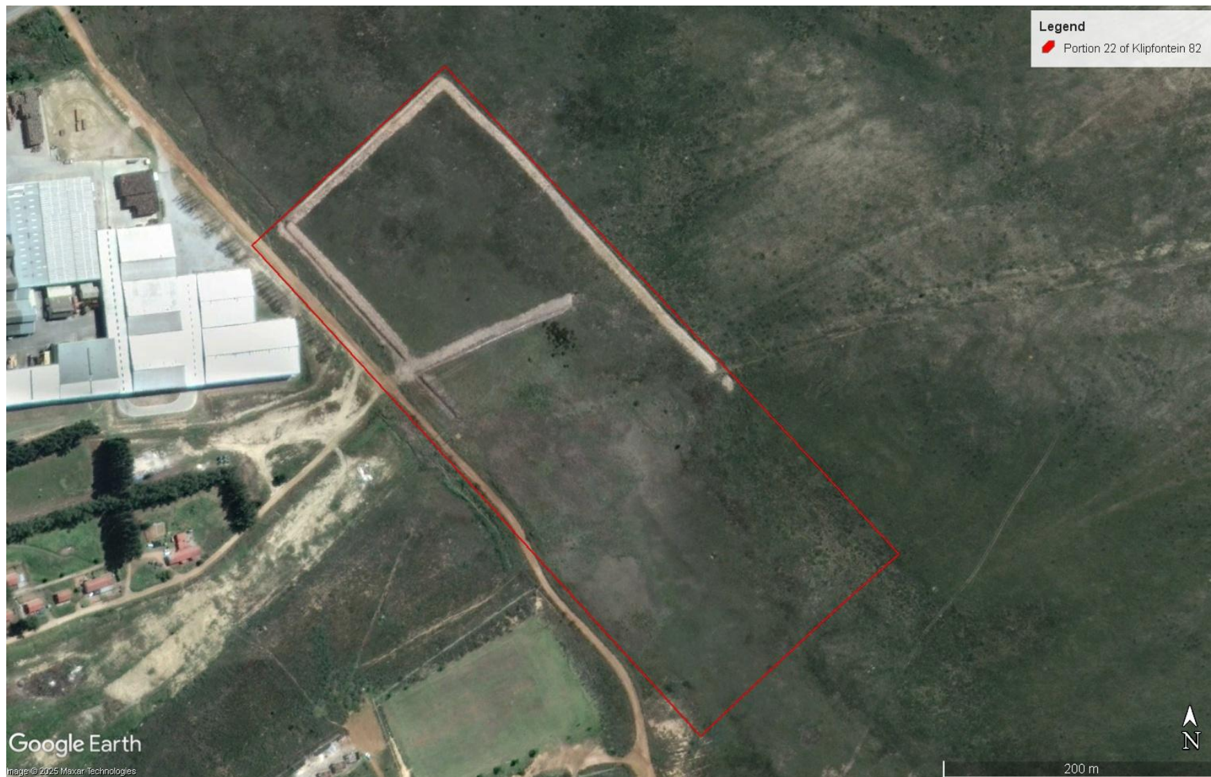
Figure 2: Aerial imagery from 2017 showing the illegal trench building activities of the previous owner.