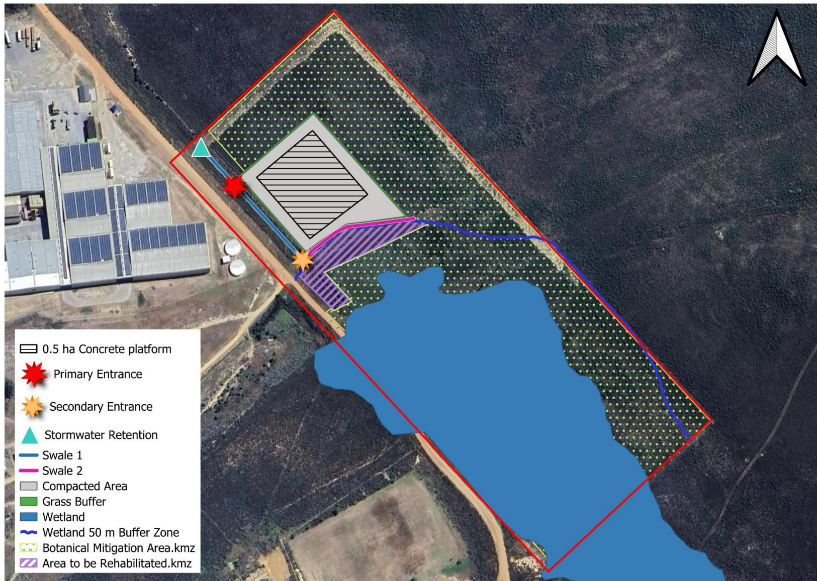
Figure 5: Map of the study area showing Alternative layout 2, the preferred alternative in relation to the entire property.