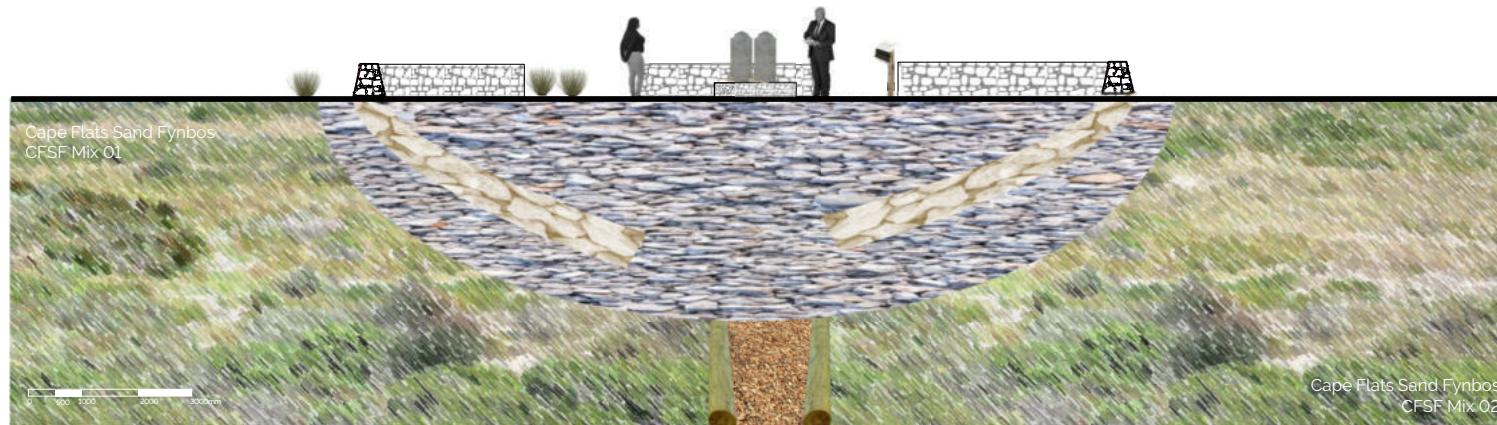
Plan Section 02 Remembrance stone central cycle 5.01

Pathways to circle to be bordered by gum poles and filled with 13mm crushed stone aggregate ('klippies'), similar to other areas on campus.