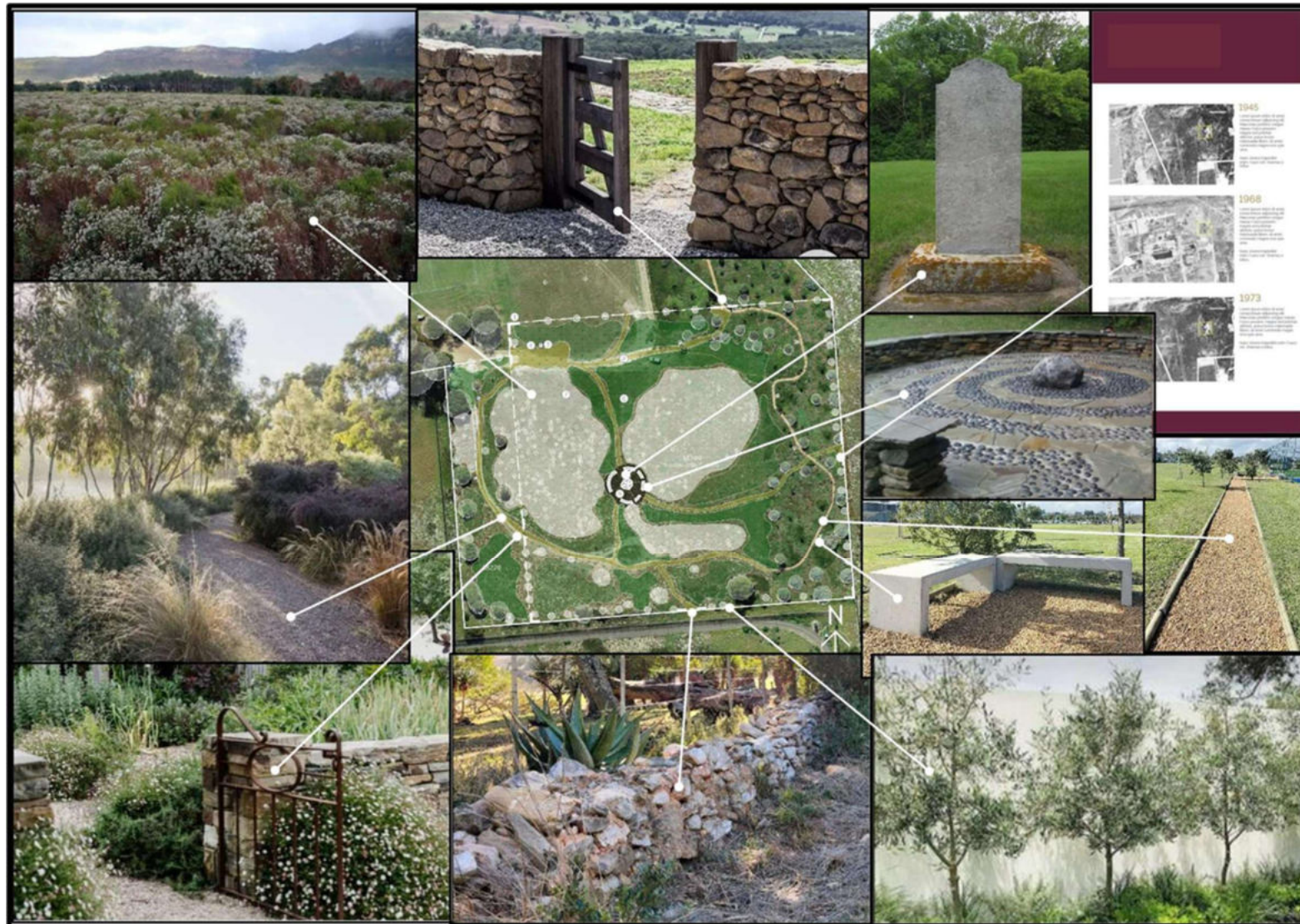
Figure 1: Proposed "Look & Feel" of the Memorialised Area.