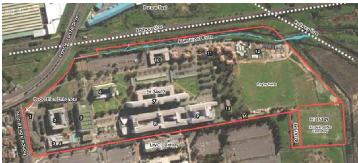
Image 3: A Google Earth image from 2017 as extracted from a heritage application (Perception Planning 2017 – Appendix D p.5). This image illustrates the most recent expression of university land ownership in relation to the campus. In this iteration the acquisitions of 'Portion 27' and 'Lot Med' in the 1960s have been amalgamated to form Erven 24602.

noted in the deed of title most likely reflected a symbolic number since the university had already given the local government part of Erf 14299 ('Lot Med') for the development of a road network. This act might have been factored as a form of compensation for the acquisition of the cemetery - although this is not specified in the documents consulted.