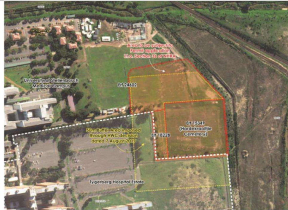
Figure 1: The area delineated in yellow polygon to be treated as a 50m Buffer Area as imposed through HWC's decision dated 7th August 2017. Development within the 50m Buffer Area would trigger a Permit application in terms of Section 36 of the NHRA. Red polygon represents portion of land owned by University of Stellenbosch (Perception Planning, 2017).

Furthermore, to determine the buffer area required on Erf 24602, and to determine whether any graves are located within the buffer zone, GPR Scanning was undertaken within the study area and beyond to determine if any anomalies are present. The GPR study indicated 6 potential grave targets within the area. A ground-truthing permit was requested and approved by HWC for Jayson Orton to undertake the test excavations of the potential grave targets under community observation. The test excavations concluded that no graves are located at any of the 6 targets indicated in the GPR Scanning. Jayson Orton is an independent accredited professional and on the basis of the outcome of his report (in addition to all the information and research undertaken prior to his report), it was determined that the 50m buffer (in the north) can be reduced, as: "It is considered highly unlikely that burials occurred outside of the known historical Hardekraaltjie Cemetery, and it is recommended that this portion of Erf 24602 should not be considered as potentially being part of the historic cemetery."