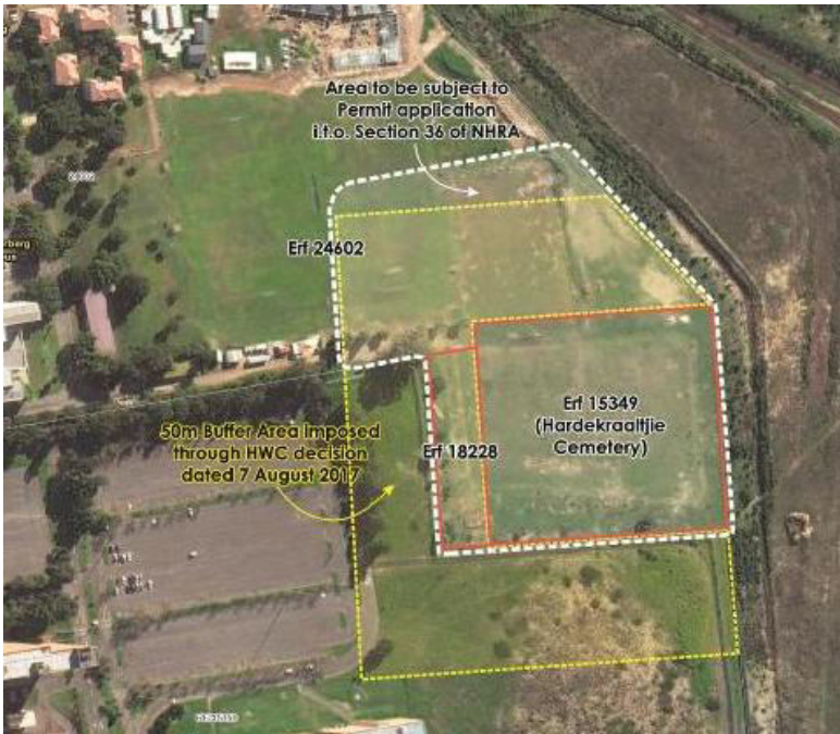
Image 4: This image was presented in Perception Planning’s Heritage Impact Assessment of 2019. Erf 15349 (Hardekraaltjie cemetery) is indicated by the red border, and the white dotted line indicates the imposed buffer zone on Stellenbosch University’s campus on Erf 24602 (previously Erf 15348).

As illustrated by the image 4 , this 50 meter buffer zone is located outside of the historical boundaries of Erf 15349 (Hardekraaltjie cemetery). More recently, as part of the latest endeavour to memorialise the cemetery site, and upon request from representatives of one of the affected communities (Ravensmead), the designated buffer zone was subjected to Ground Penetrating Radar (GPR) scans which identified a number of underground anomalies located in the buffer zone (thus on Erf 15349 acquired in 1967, currently Erf 24602). Upon further investigation, which consisted of ‘test excavation’ performed by an appointed archaeologist in January 2026, it was determined that these anomalies did not constitute burial sites (Orton 2026).